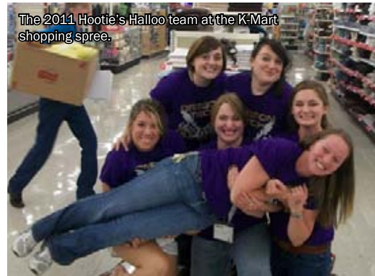
The 2011 Hootie's Halloo team at the K-Mart shopping spree.