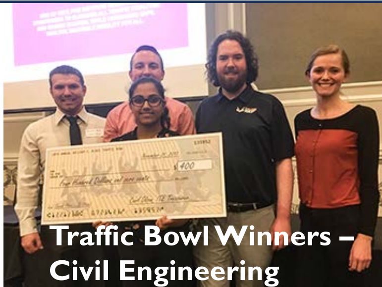
Traffic Bowl Winners – Civil Engineering