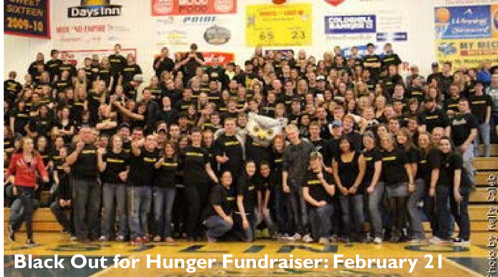
Black Out for Hunger Fundraiser: February 21

UPCOMING ATHLETIC EVENTS RAISE AWARENESS & HELP OTHERS