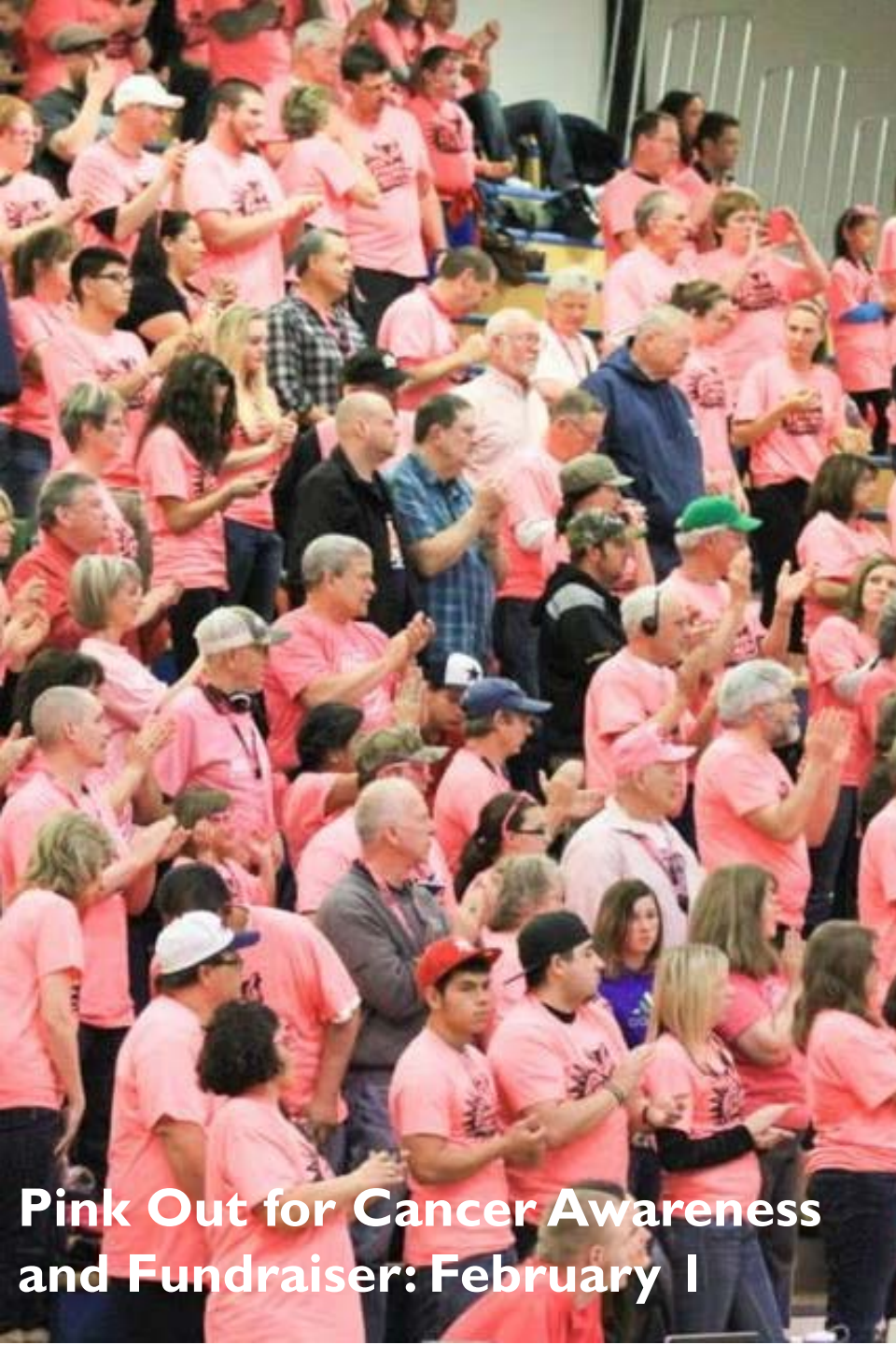
Pink Out for Cancer Awareness and Fundraiser: February 1