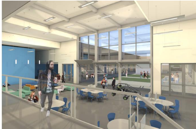
Cornett Hall Phase II $7.0M